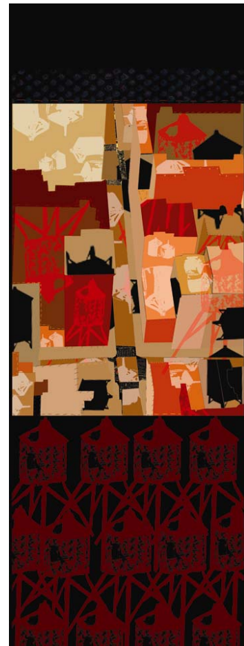
Fig. 2 Empire State Digital print on cotton velvet Size: 200cmx 50cm