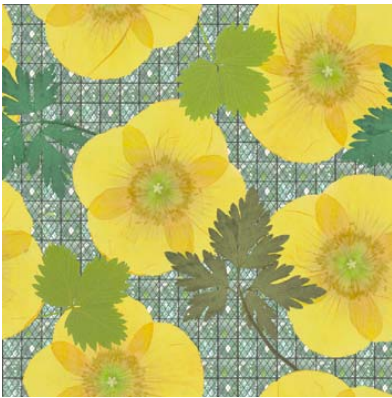
Fig. 3 Wales Design Collection